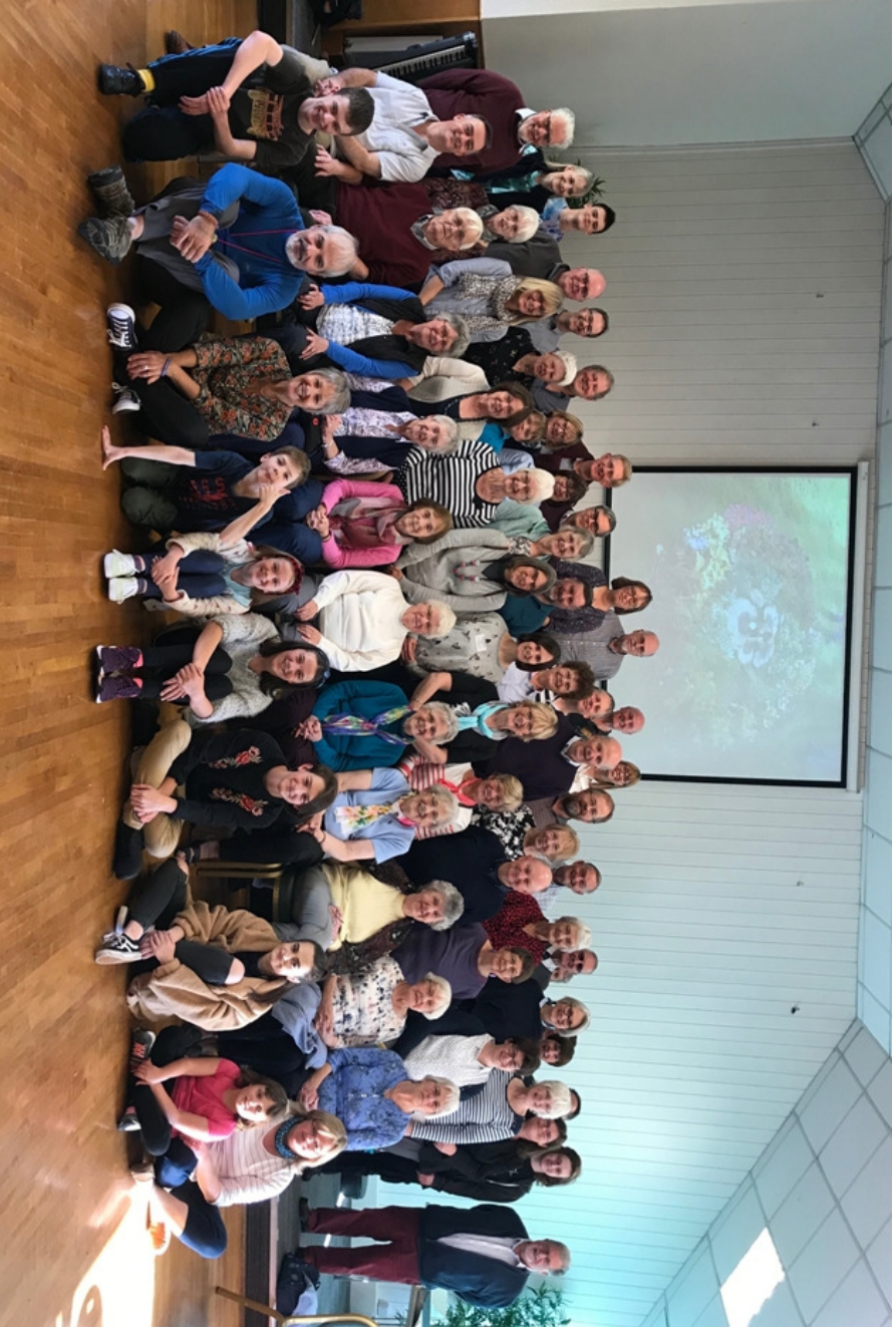
Circuit Weekend at Swanwick – September 2018