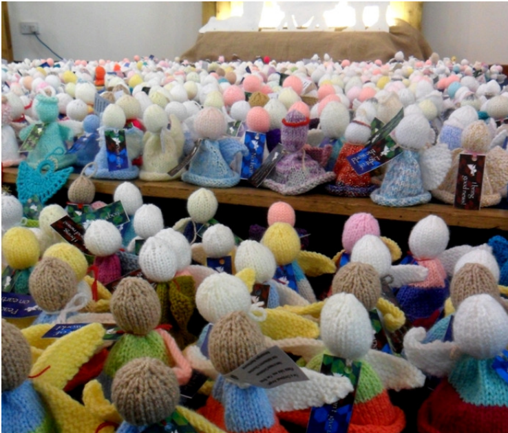
Angels in church prior to their mission (see Page 10)