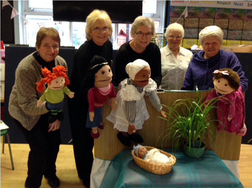
Open the Book in action