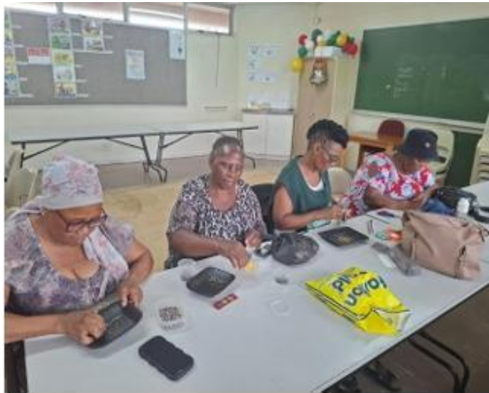
Phakimisa Ladies known as Gogos