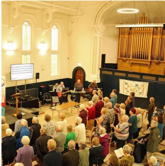
Morning Worship in Trinity Hall