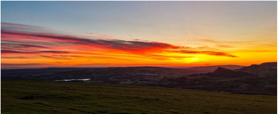
Sunset over Leek

Ashbourne, Brailsford, Kniveton, Kirk Ireton, Tissington, Parwich, Milldale.