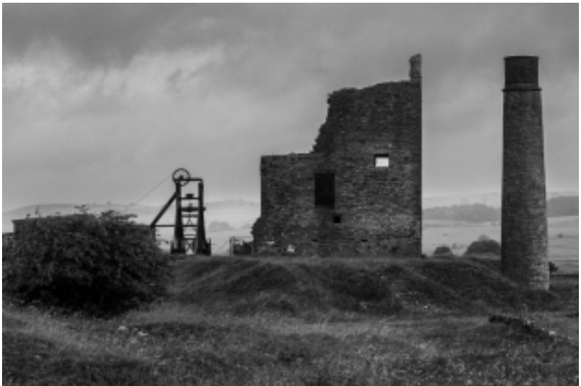
Magpie Mill near Bakewell