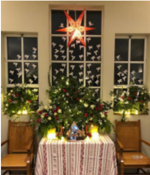
Tissington at Christmas